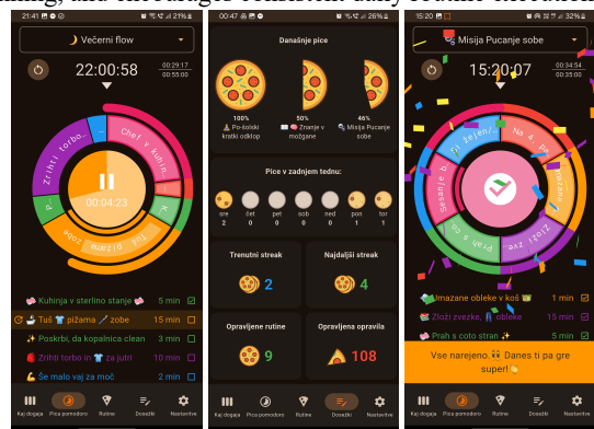
Figure 2: Screenshots of: routine execution page (left), reward page (middle), visual-audio congratulatory message upon completing a routine (right)

For supporting weak organizational skills, the application includes routines made of consecutive tasks with defined durations but no fixed start or end times (Figure 1, right). When the first task begins, the Pomodoro timer starts (Figure 2, left). Visual cues, color coding (lighter shades for elapsed time), and sound alerts encourage timely completion. Each completed task is marked, and the user is rewarded with a slice of pizza (Figure 2, middle). Upon completing the entire routine, a visual-audio congratulations message is displayed (Figure 2, right), along with the full pizza as a reward. This system enhances focus, improves planning, and encourages consistent daily routine execution.