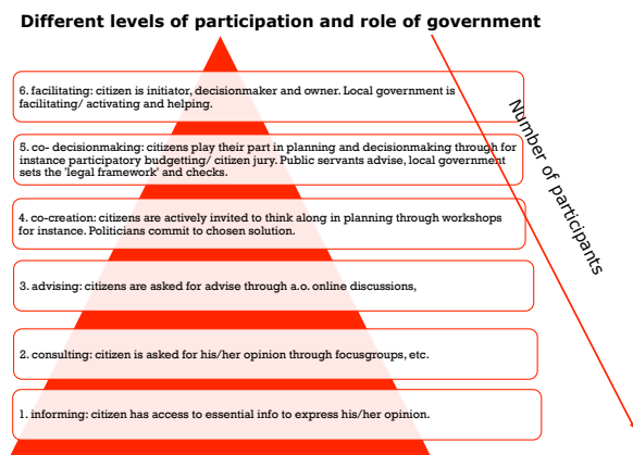
Figure 1: Levels of participation

Since citizen participation is a necessary step when organizing a datacommons and is essential for two design principles of a successful data commons, a major concern when it comes to a local government organizing or facilitating a datacommons is the participation of citizens. Is this a ‘ contradictio in terminis ’ or can and should the government act as a facilitator or incubator? Looking at the participation ladder by Arnstein [2] there is, indeed, a world to win, also calling for a different role of the government: a ‘ co-creating government ’ or ‘ co-city ’.